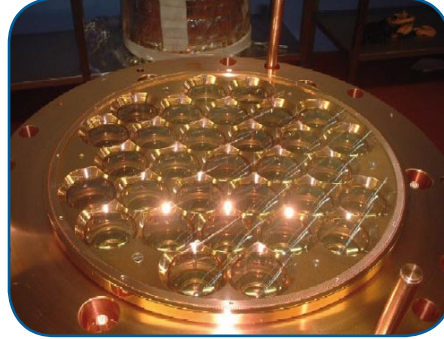
Internal view of the photomultiplier (PMT) array within the ZEPLIN III detector. 31 2" PMTs are arranged in a hexagonal pattern. Above the PMTs there are two wire grids used as part of the electrode structure to define the electric fields.

The ZEPLIN III instrument is a two-phase xenon detector. The liquid phase of xenon provides a high density 'target' for the dark matter sparticles. Occasionally, one of these sparticles will scatter from a xenon nucleus in the liquid causing a brief flash of UV light, which is detected in an array of photomultipliers immersed in the xenon. At the same time ionization electrons are released which drift towards