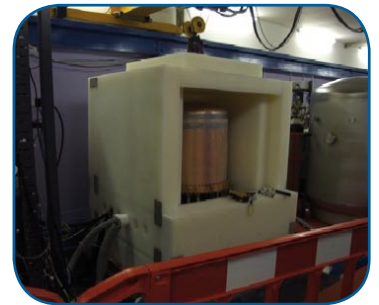
The full ZEPLIN III instrument in place in the Boulby underground laboratory within its inner layer of passive neutron shielding.

The instrument is performing as expected and the final installation at the Boulby mine, which is located in north-east England is under way. A science-run will start in the new year. The first run will last for two months and should give a result comparable to current best sensitivities. Following this run the PMT array will be swapped for a specially commissioned low-background version, which will enable ZEPLIN III to go another order of magnitude deeper in sensitivity. At this level it will be probing some of the more favoured theoretical supersymmetry models and if nature is smiling upon us the first sparticles may show themselves in ZEPLIN III.