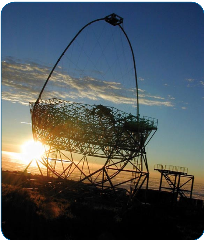
The first MAGIC telescope at sunset, will be joined in early 2008 by a second telescope, MAGIC II. It will increase sensitivity and resolution for tracking gamma-ray sources of the Universe.