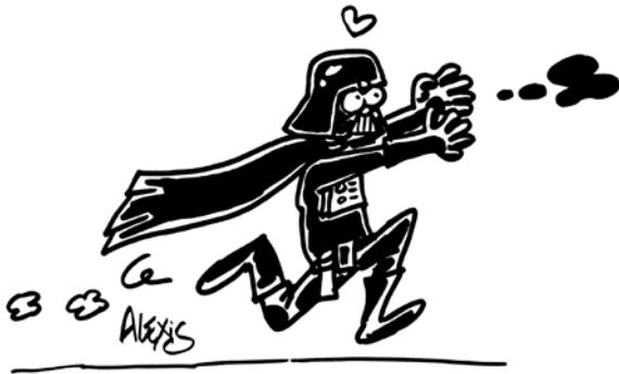
Running after dark matter.

The direct detection of dark matter particles in the halo of the Milky Way would have profound implications for cosmology, particle physics and, possibly, to the whole of physics as we understand it today. Over the past decade a number of separate astronomical observations have been brought together to produce an impressively consistent model of the Universe. A new component of the Universe, known as 'cold dark matter', is required in quantities that outweigh normal matter by several times. Weakly interacting massive particles (50-1000 GeV) would meet the requirements for this component. Adding to this the existence of supersymmetry, which as a theoretical framework that is able to unify all the forces of nature, including gravity, predicts specific new 'sparticles' (i.e. supersymmetric particles) with just the right properties and we have a very well motivated scenario.