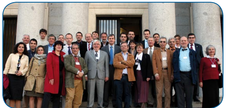
About 40 people from the European funding agencies attended the Spanish ASPERA National Day on the 6 November 2007.

As in previous National Days, Stavros Katsanevas closed the event with a summary of the main conclusions learned during the day. The beautiful place and the paella gave a very nice Spanish touch to this 6th National Day!